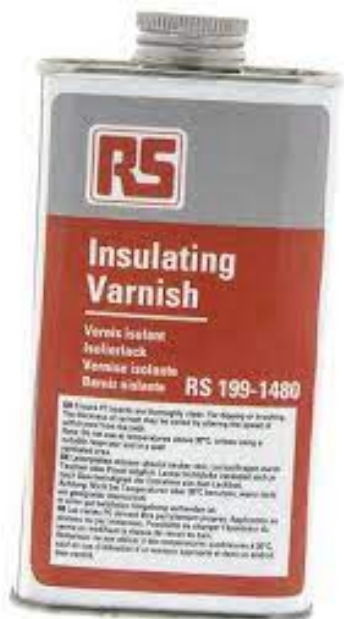
Reference: UI-45154-147 RS199-1480 Picture -